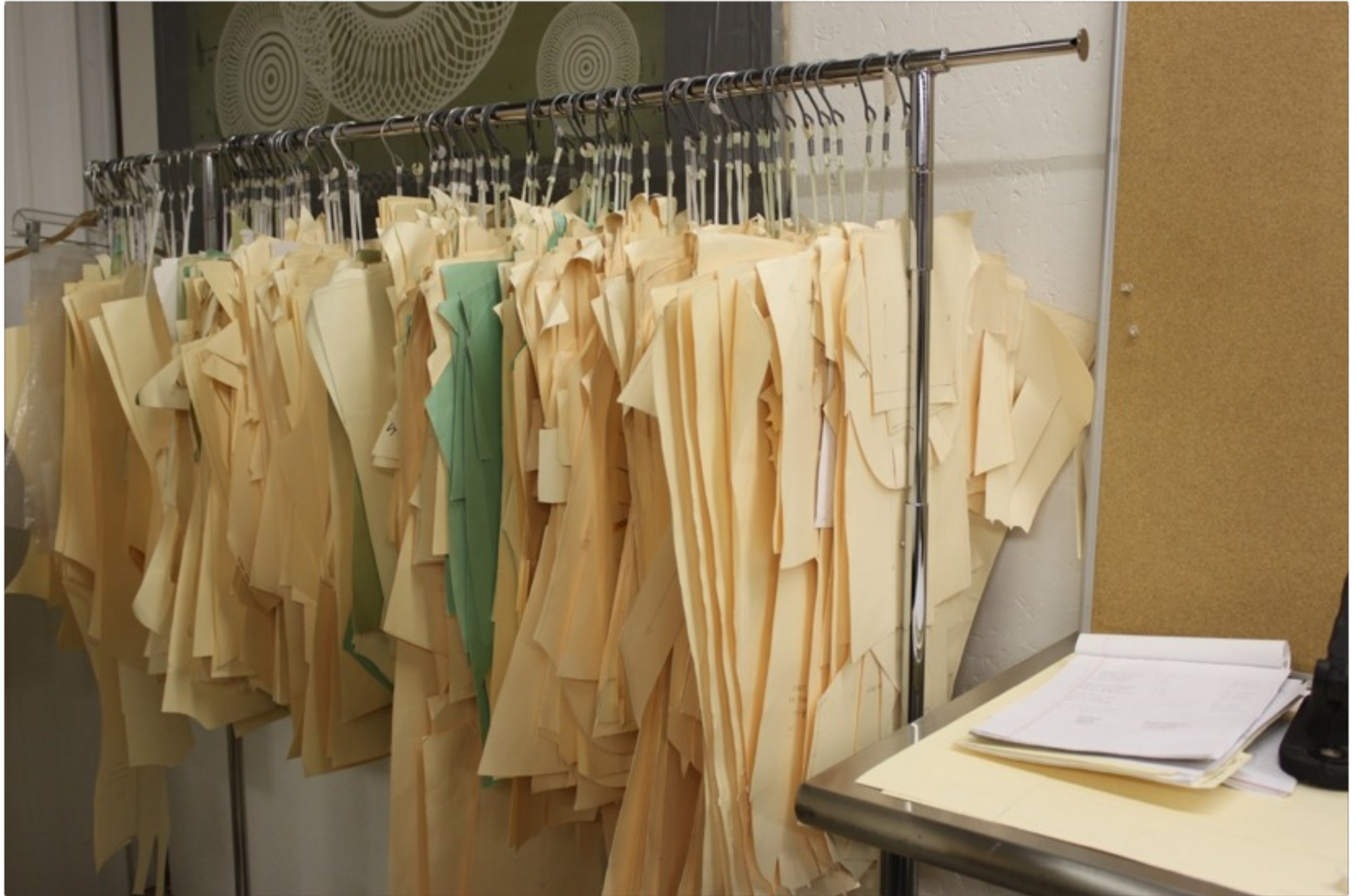
ALBAMA CHANIN PATTERN COLLECTION