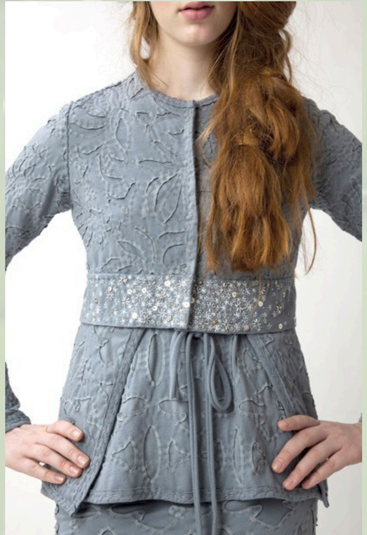
REVERSE APPLIQUE BEADED GARMENTS