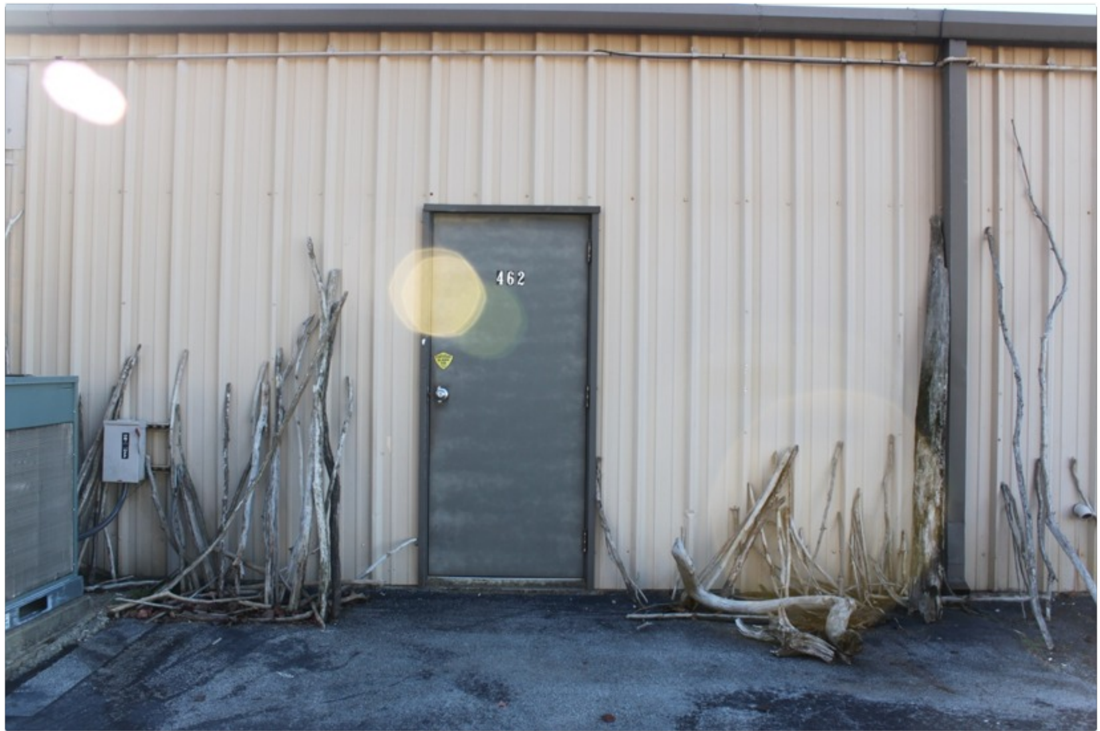
ENTRANCE TO ALABAMA CHANIN INDUSTRIAL PARK, FLORENCE, ALABAMA