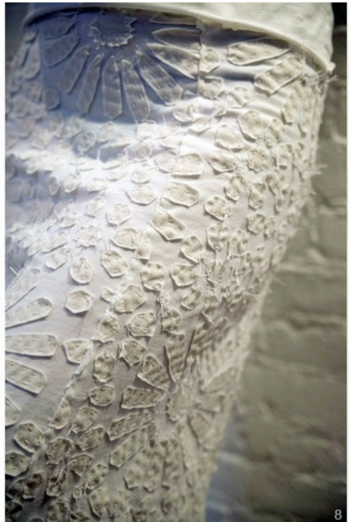
APPLIQUE WEDDING GARMENTS