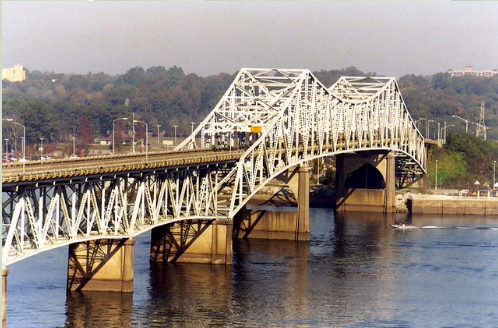
O'Neal Bridge and the Tennessee River with the Florence skyline in the background.